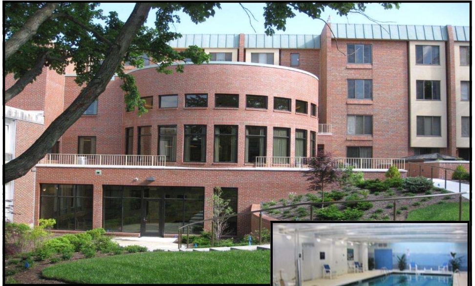
Marjorie P. Lee Retirement Community Wellness Center Addition Cincinnati, OH

To be the most professional, high quality, customer driven General Contractor in Greater Cincinnati.