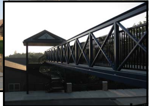
St. Ursula Villa